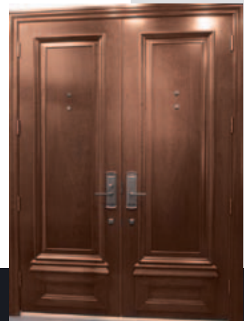
Detail : "Elegance" double door with "Versailles" optional bottom panel